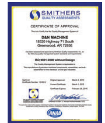
ISO 9001:2008 Certified Company