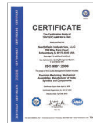
ISO 9001:2008 Certified Company