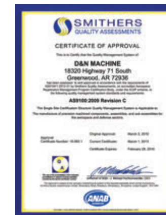
AS9100:2009 Revision C Certified Company